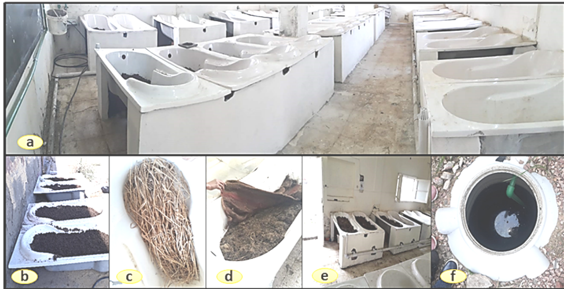
Pic. 1. The Organic Vermicompost Production Unit.